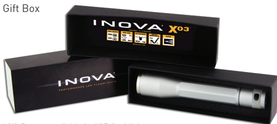
*Gift Box not available for X3R flashlight

Please check with your salesperson to learn more about gift box availability